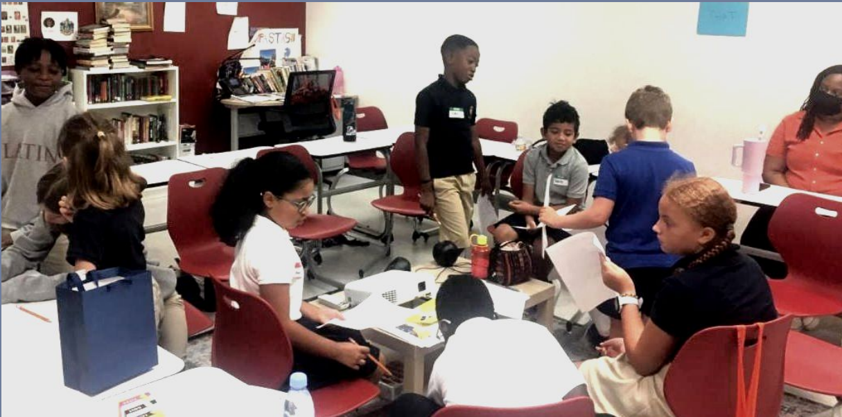
Students at Washington Latin engaging in small group work during a Touchpebbles lesson

Touchstones is taking hold in two Washington DC public charter schools, Girls Global Academy and Washington Latin Public Charter School Cooper Campus, thanks to a grant from the Jack R. Anderson Foundation. The grant provides funding for Touchstones discussion curricula, workshops, and coaching for expanded programming at Washington Latin and a pilot implementation at Girls Global. A summer PD session at Washington Latin was followed by orientation classes with new incoming students at the Cooper Campus. That included an art competition that was connected to the students' Touchpebbles discussion.