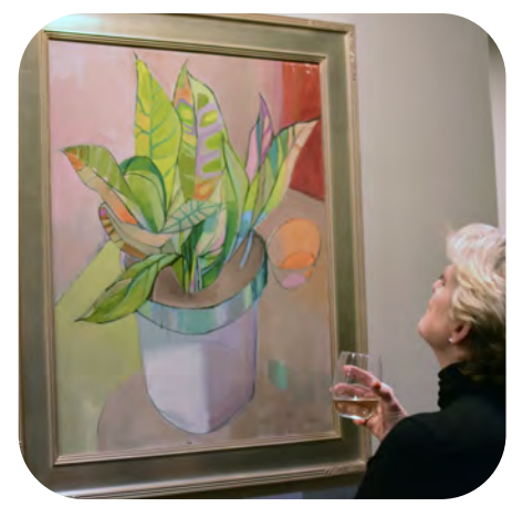
A guest admires Zuckerman's luminous "Potted Plant" during the exhibition.

This endowment allows us to plan for and achieve strategic priorities. Among the most pressing is growing our staff to meet the increasing demand for programs that teach skills of civil