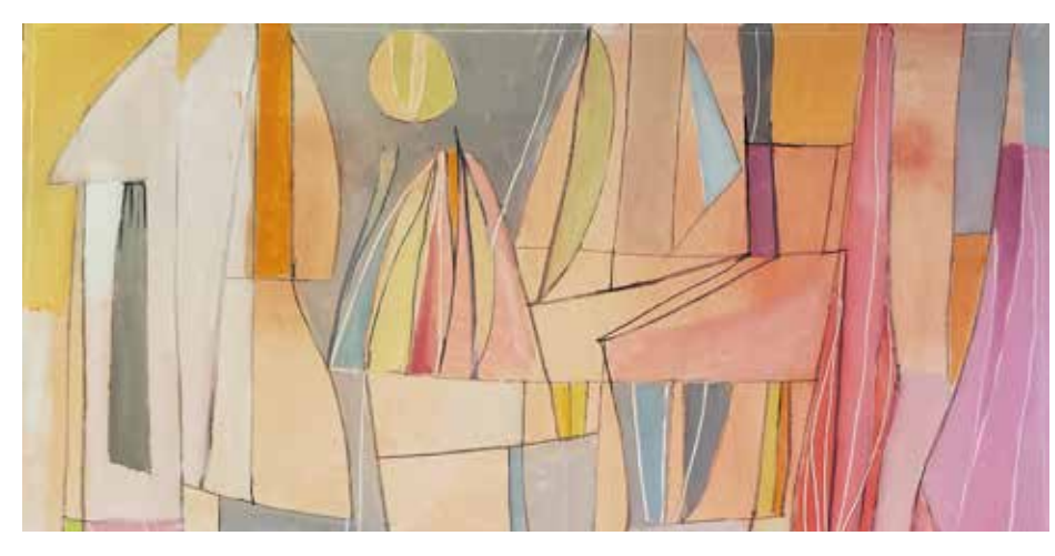
Elliot Zuckerman's, Figuration 13 (1997), oil on canvas with charcoal.

We spent the majority of our conversation talking about her experience being on the panel