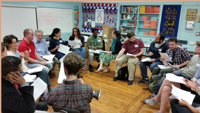
A teacher professional development workshop that took place at Columbia Secondary School for Math, Science and Engineering, New York City.