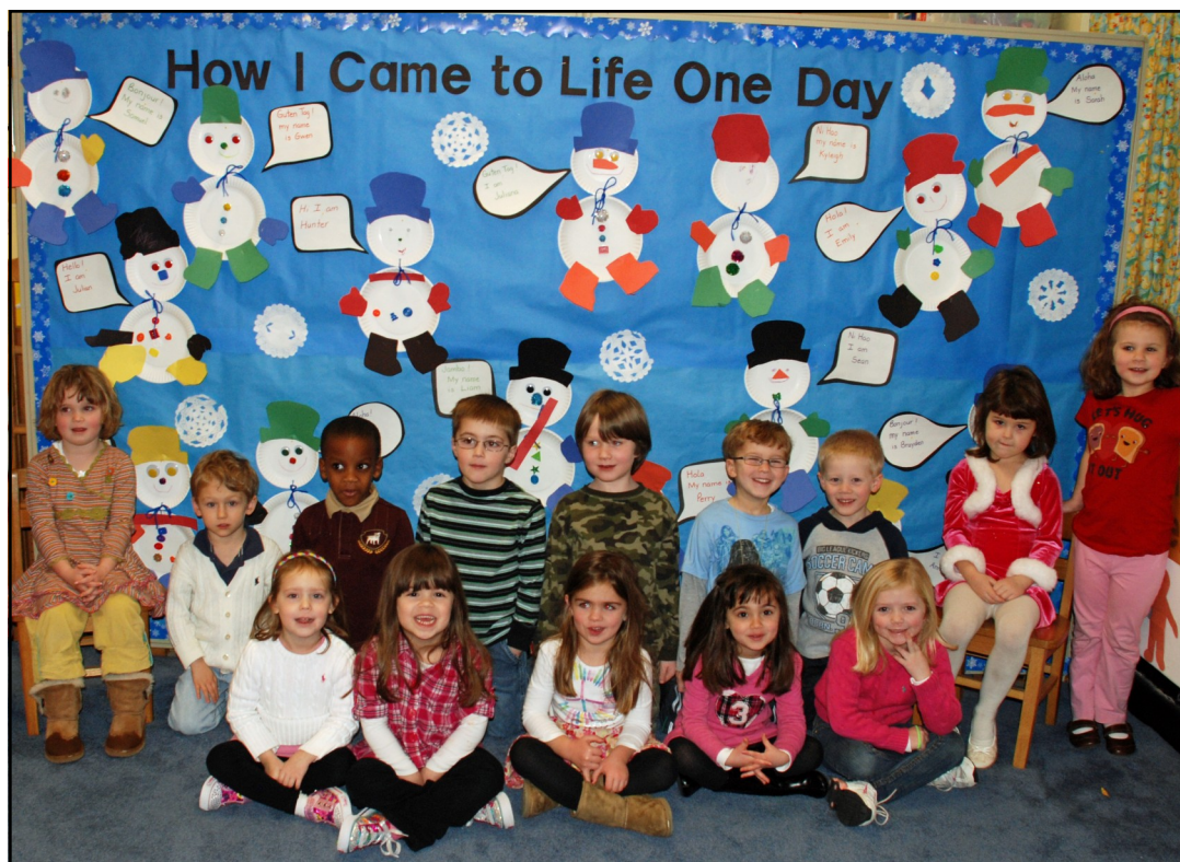
The Full Day Pre Kindergarten class shows off their snowmen offering greetings in multiple languages.

Full-Day Pre-K has taken the concept of world view to another level. The students have learned about various celebrations, traditions, and customs from several different countries. In December, the children studied Christmas in Germany, African traditions, and Hanukkah. The students took such an interest that we continued our study with languages. The children learned how to say, “hello,” in seven different languages. This carried over to a wonderful bulletin board display. Simply walk into the room and you may hear, “Buon Giorno,” “Jambo,” “Ni Hao,” and more.