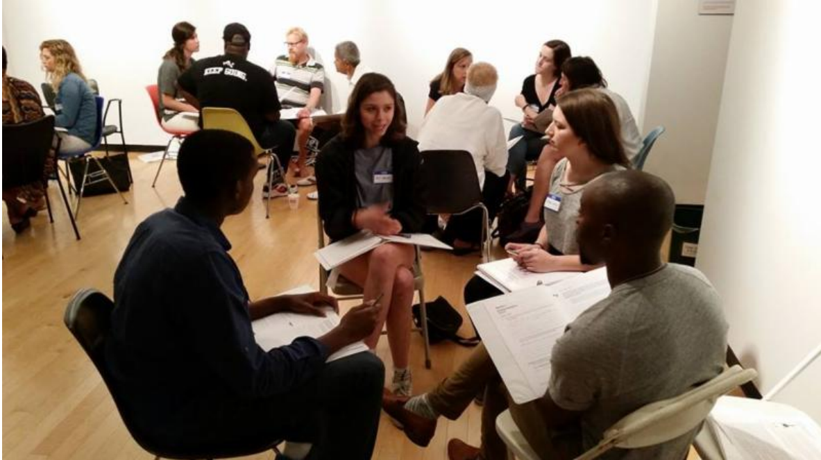
Workshop participants explore leadership techniques during the morning session at the Halsey Institute of Contemporary Art.

Karole's reflection on the workshop continues to describe the afternoon session: